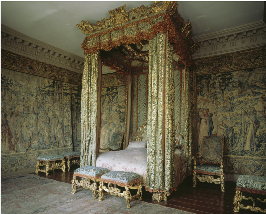
Fig. 1. Overall of bed

State bed, upholstery, alterations, historic repair, adhesive, archives, James II