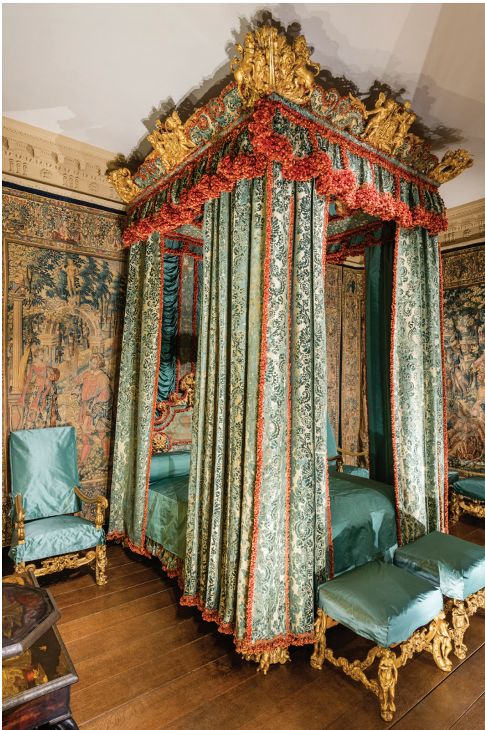
Fig. 28. After conservation and installation.