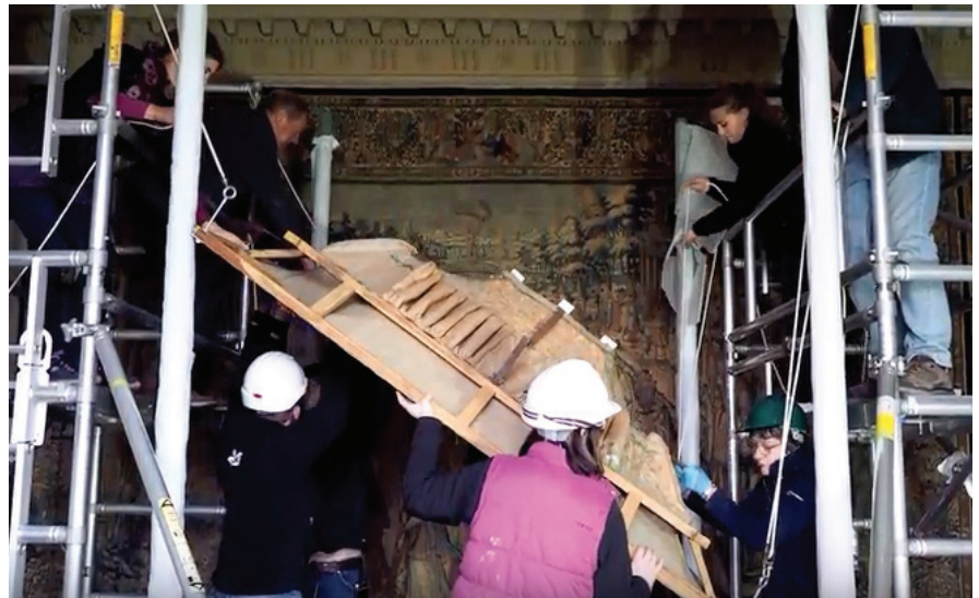
Fig. 26. Installing the bed at Knoke.

The bed was finally installed in the Venetian Ambassador's Bedroom in October 2018 (figs. 26 - 28).