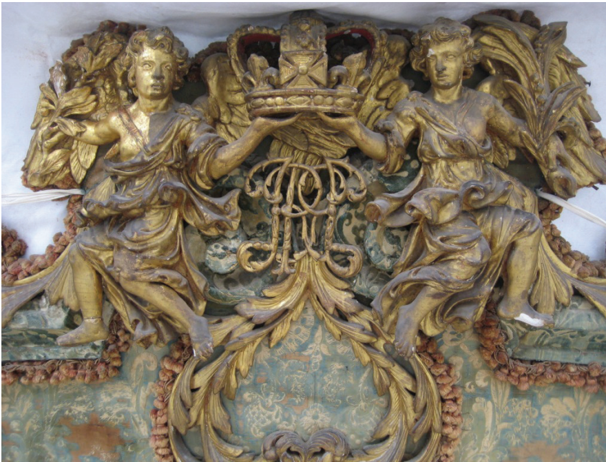
Fig. 14. Trial cleaning of gilding.