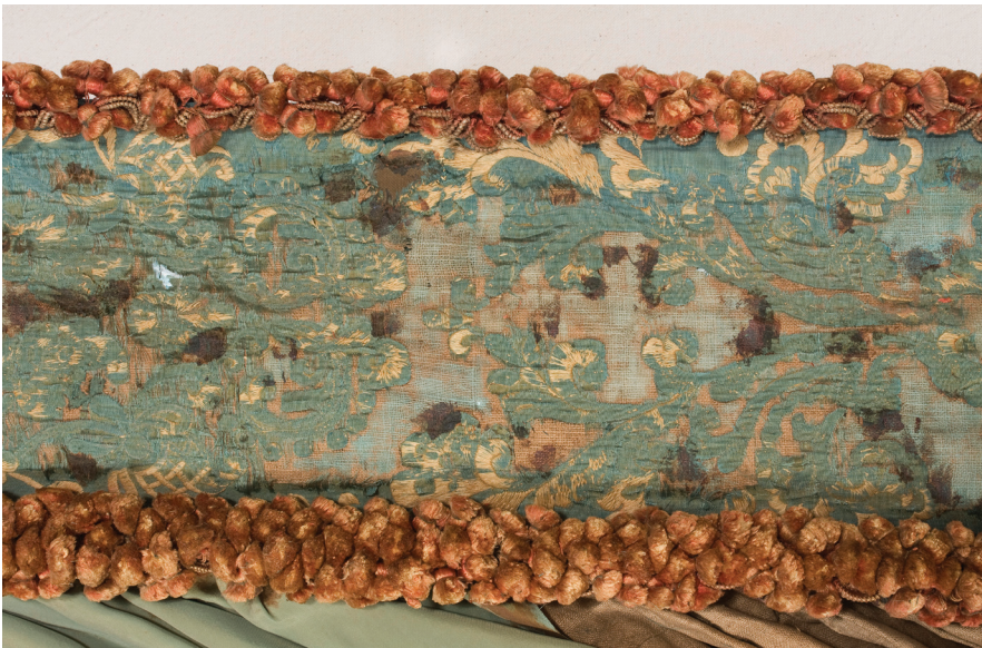
Fig. 8. Adhesive hardened and brown on headcloth.