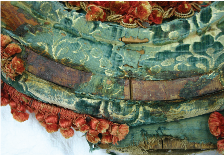
Fig. 18. Areas of bare wood before treatment.