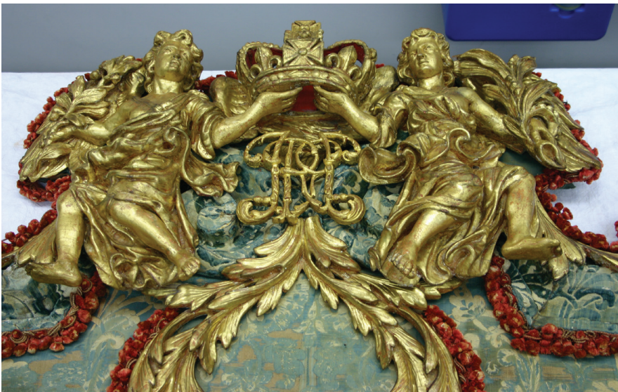
Fig. 15. After cleaning, treatment and new cross on top of the monde.