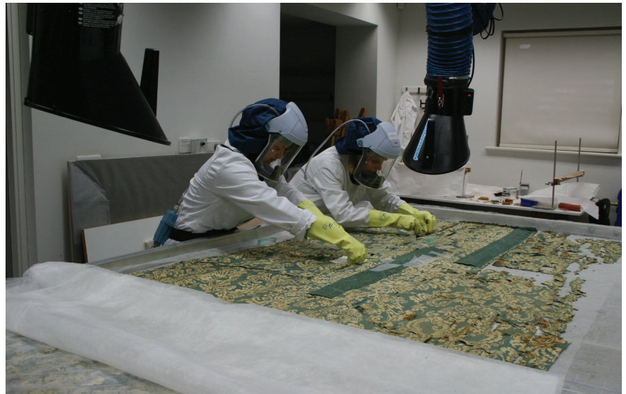
Fig. 9. Adhesive removal on the curtains.

In 2004 funds were made available for the pilot project to treat the first set of curtains (that had been removed from display 17 years earlier) (fig. 9). This involved adhesive removal, specialised wet cleaning and support of the textiles with sympathetically dyed conservation fabrics.