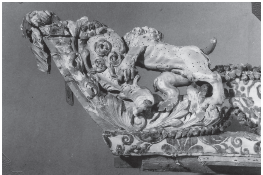
Fig. 5. Cornice during RIB treatment.

In the case of the bed, they replaced carved losses (figs. 5 and 6), re-gilded and repainted certain elements, altered the configuration/construction of the bed frame (especially the tester rail), and repaired the textiles. Unfortunately the methods and materials that were used did not stand the test of time, and only 10 years later during a survey, the textiles were described as very fragile, dry and brittle.