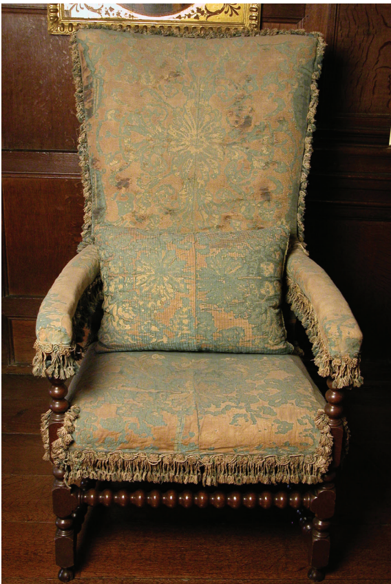
Fig. 4. Chair on the brown gallery upholstered with original counterpane from James II Bed.

Curatorial research has revealed that the room and furniture has undergone some changes since 1700, but other than evidence of repairs to the curtains in the 18th century, it seems that the redecoration, re-upholstery and re-arrangement of the furniture occurred in the latter part of the 19th century (fig. 4).