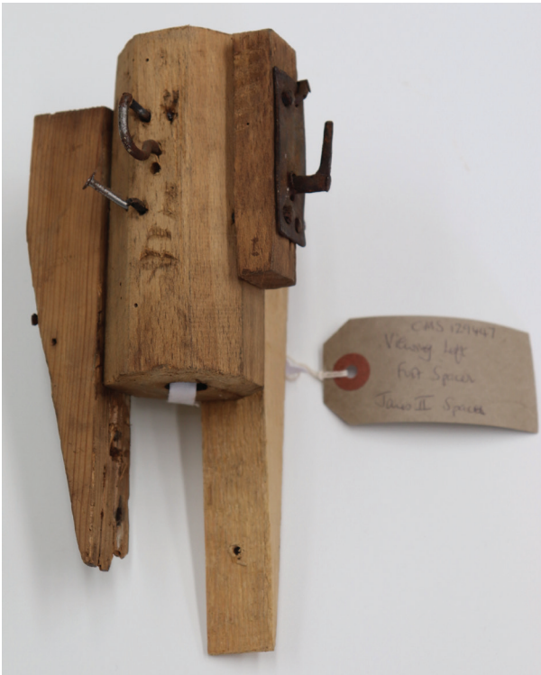
Fig. 24. RIB curtain hanging technique.

together; supplied stainless steel screws to fit the cornice to the new beech frame; made 3 new rods to hang the cantonnieres; and curtain/cantonnierre rod hanging brackets to fit the top of each bed post.