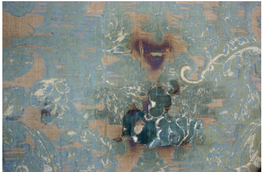
Fig. 13. Velvet adhered patches.