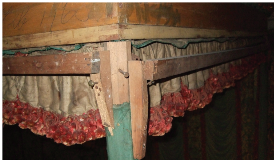
Fig. 22. Alterations by RIB.