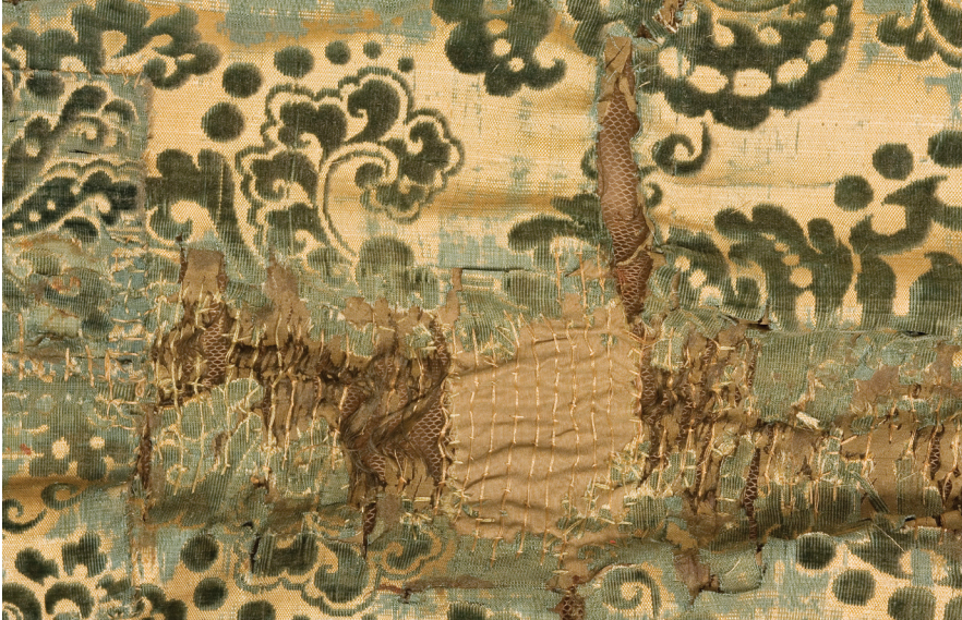
Fig. 7. Introduction of synthetic fabrics and coarse stitching by RIB on foot curtain.

The RIB had replaced original silk with synthetic fabrics, introduced very coarse threads for the couching stitching, and applied a significant amount of adhesive (fig. 7). The adhesive, identified as gutta percha (chemically similar to natural rubber), had discoloured to an unsightly dark brown colour, oxidised and become hard, and was failing, putting strain on the surrounding fabric (fig. 8). Tests showed that it could only be softened with dichloromethane and then rinsed through with warm de-natured alcohol (methylated spirits), and this required extraction equipment. The likely treatment costs were escalating, and there was discussion about how the bed should be displayed following treatment, in order to extend the period before any subsequent re-treatments might become necessary.