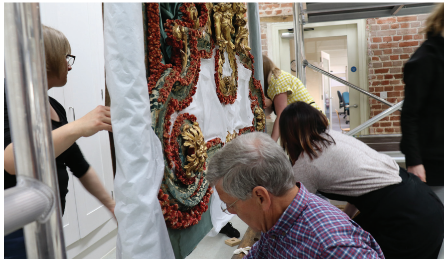
Fig. 21. Bed trial at studio.