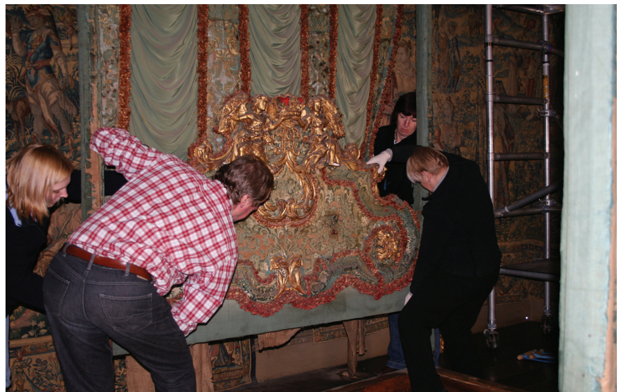
Fig. 10. Removing the headboard in 2009.