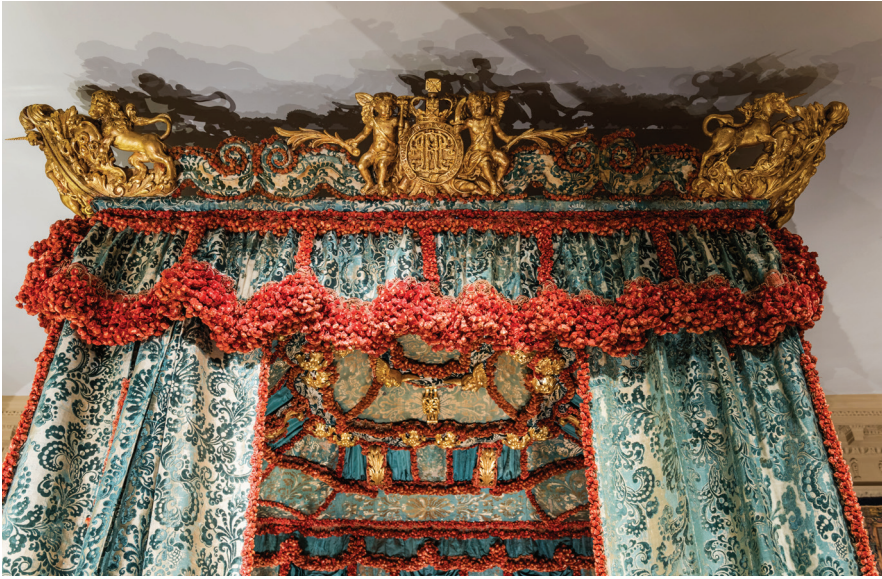
Fig. 27. Detail of bed after conservation.