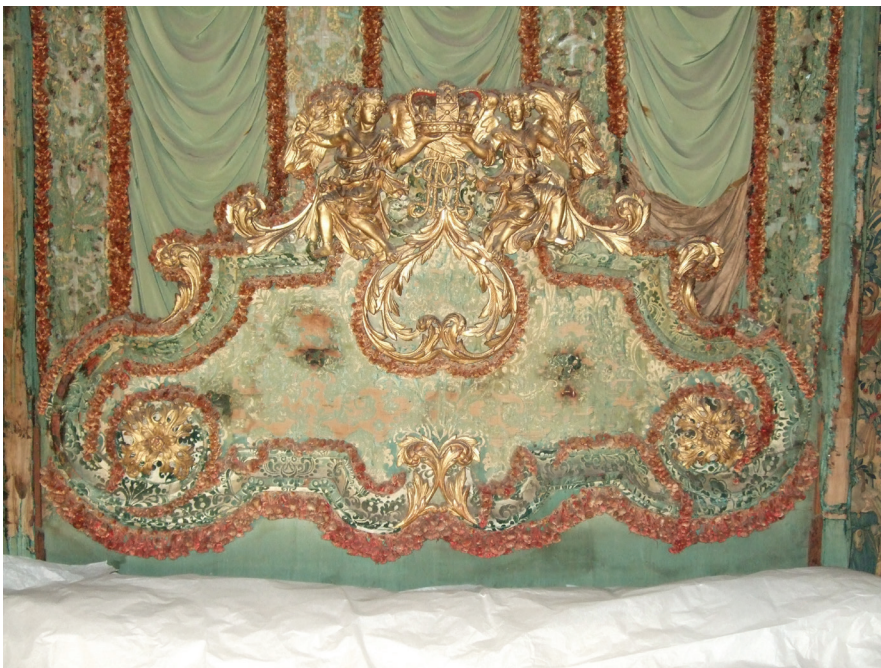
Fig. 11. Headboard before conservation.

The headboard comprises a shaped flat base of wooden boards, covered in silk, with applied carvings and mouldings, some covered with fabric, others water-gilded, further embellished with cream and russet trimmings (fig. 11).