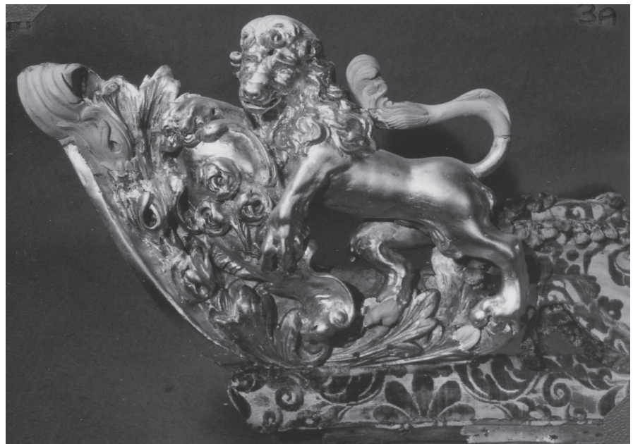
Fig. 6. Cornice after RIB treatment.