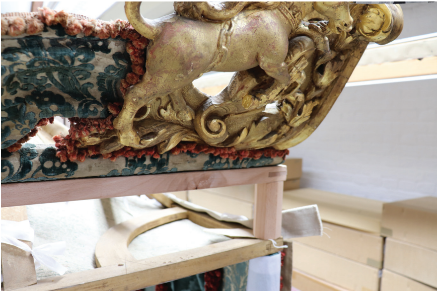
Fig. 23. New beech rail and octagonal spacers to replace RIB frame.