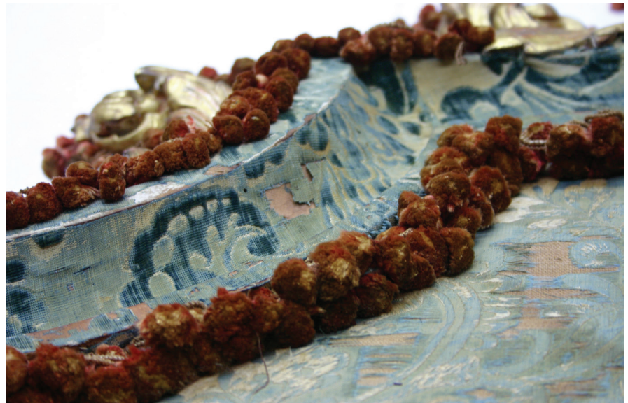
Fig. 12. Areas of missing velvet and silk ground.