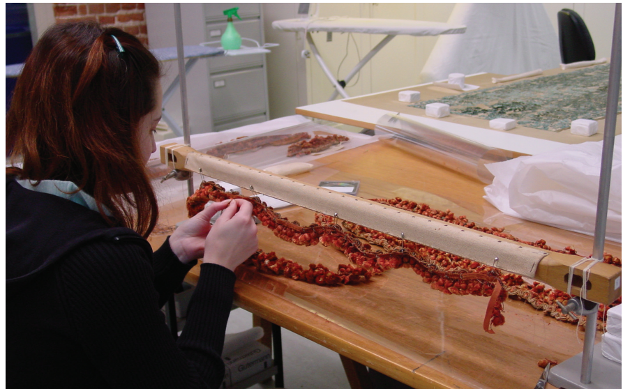
Fig. 16. Supporting trimmings to new dyed cotton tape.