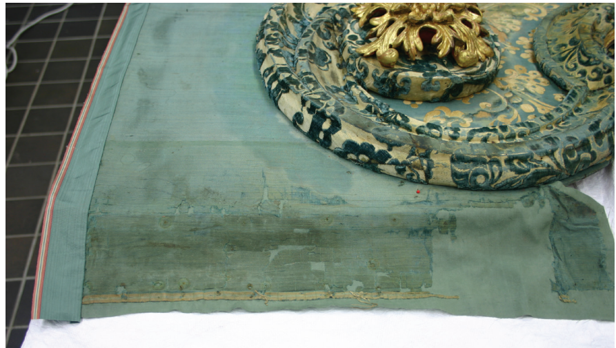
Fig. 17. Spit silk after conservation.

The adhered velvet patches on the embroidery were removed with the aid of a spatula. Poultice tests were carried out on the embroidery to see if the darkened adhesive could be removed or lightened, but to no effect. It was felt that it would be safer to leave the remaining adhesive in place, and disguise its appearance with the addition of the net layer.