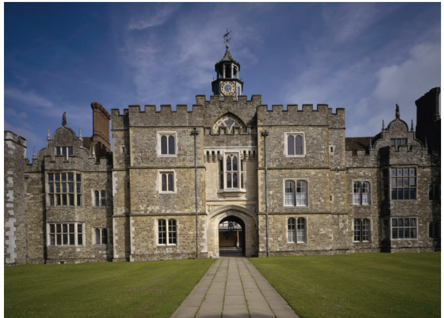
Fig. 2. View of Knole.

Knole has been the Sackville family home for over 400 years (fig. 2). Much of the collection there today was acquired from Whitehall Palace by Charles, 6th Earl of Dorset (1638 – 1706) in 1695, when he was Lord Chamberlain to William & Mary (1689-97). Royal furniture obtained as a 'perquisite' of public office has furnished the state rooms at Knole since 1701, and the James II bed and attendant seat furniture are listed in the 1706 inventory that was taken after the 6th Earl's death (fig.3).