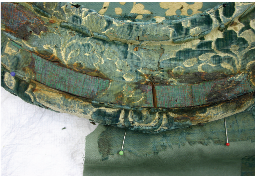
Fig. 19. Areas of bare wood after filling with acrylic paint.