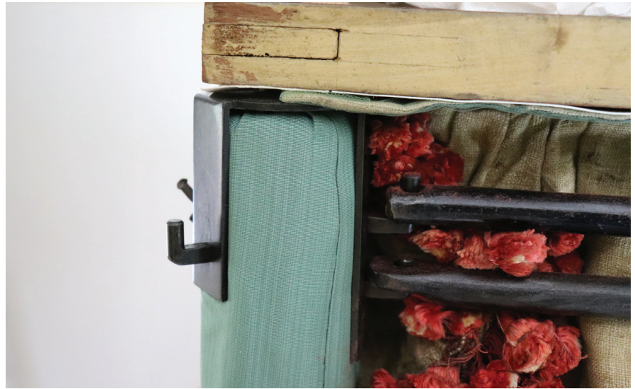
Fig. 25. New curtain hanging technique.